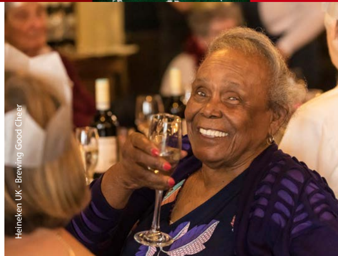
Heineken UK - Brewing Good Cheer

Please 'Join Inn' and 'Together' we can help build kinder, closer, and more connected communities by bringing people together and bridging divides.