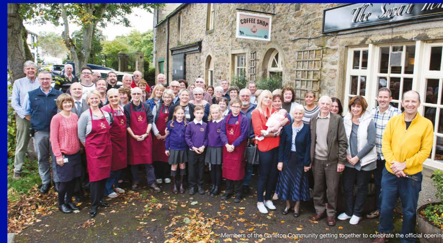
Members of the Carleton Community getting together to celebrate the official opening