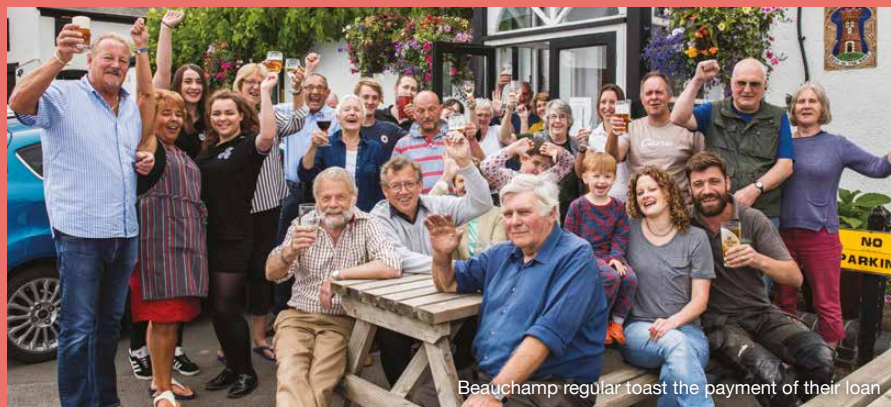
Beauchamp regular toast the payment of their loan

One of the UK's longest running pub under community ownership celebrated paying off the loan to buy the pub with a big village party.